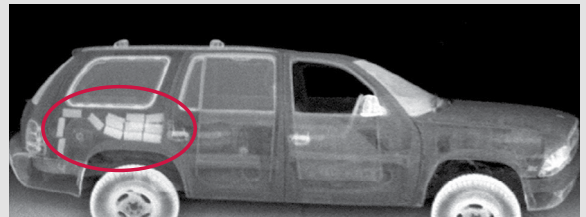
Image shows hidden narcotics